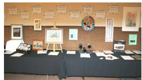
Gala Silent Auction