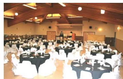
Setup for Gala