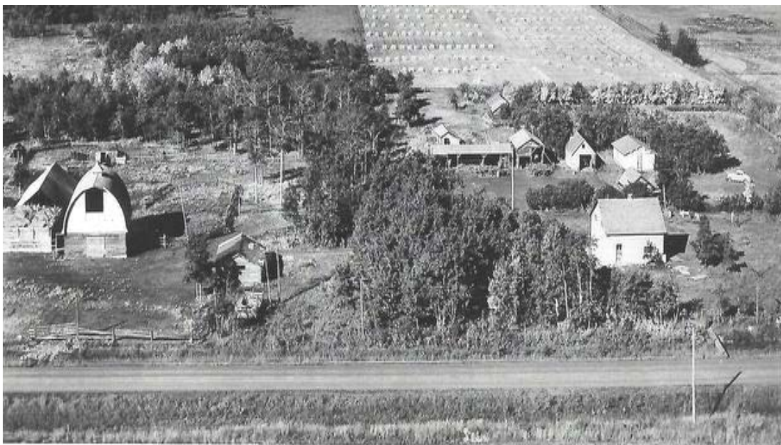
Homestead circa 1945

At only $10 a year, a membership may be a welcome gift for one or more of your friends. Mail to Box 879 Beaverlodge, AB T0H 0C0 or go to the website and pay using Pay Pal. (See page 5 as well).