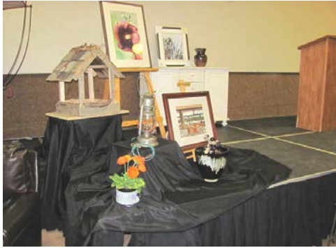
Gala Live Auction

Various options for volunteering include the Summer Festival, Annual Gala, Ghost Walk and spring maintenance of trails and grounds.