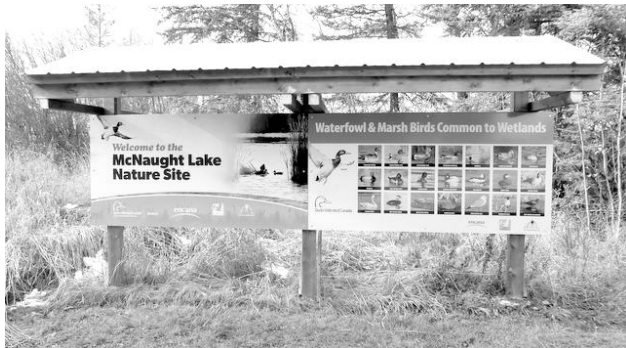
Boardwalk sign showing bird types you might see

The Boardwalk is open to the public by foot access. Park at the Homestead and follow the signs for the 20 minute walk from the barn to the Boardwalk. Observe the Trumpeter swans during the summer, hopefully with cygnets.