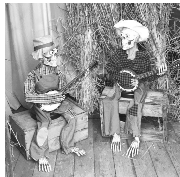
Ghost Walk band